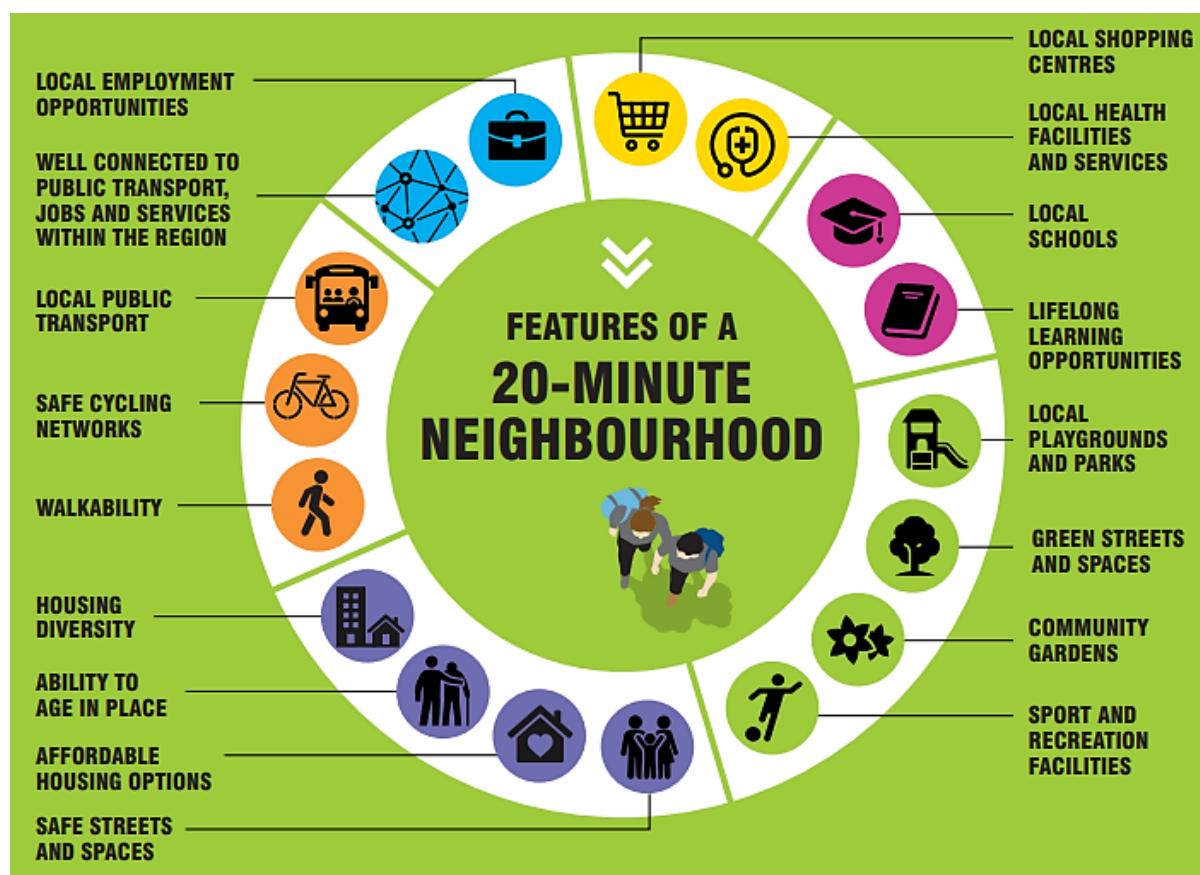
Fig 1.1 - an infographic showing the features of a 20-minute neighbourhood

The infographic below shows which features should be found in an ideal 20-minute neighbourhood.